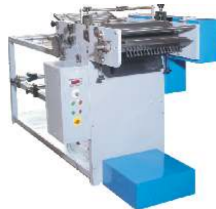
Pack Collator with Numbering, Gluing & L/P Imprinting