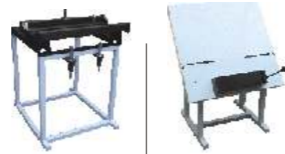
Plate Punch & Bending Fixture

ACCESSORIES & SPARE PARTS FOR IMPORTED & INDIAN PRESSES